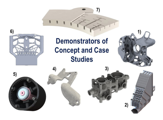
FIGURE 2 Selection of demonstrators developed in CaCS

In the field of sensor embedding, it was shown in 2019 that the three-dimensional freedom of design and the layer-by-layer buildup of additive manufacturing can be used specifically to integrate sensors within components. For this purpose, geometric and thermal boundary conditions were defined for the selection of sen-